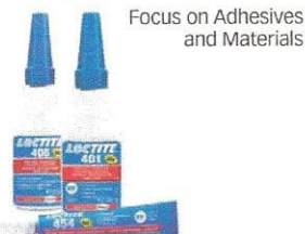
Focus on Adhesives and Materials

The latest in components, equipment, services, and supplies, with a focus this month on adhesives and materials, and automation.